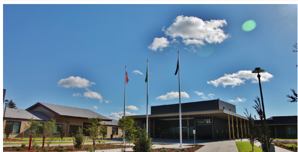
Walla Walla Veterans Home – Walla Walla, WA

Washington Soldiers Home 1301 Orting/Kapowsin Hwy, Orting, WA 98360 Call 360-893-4515 for a tour