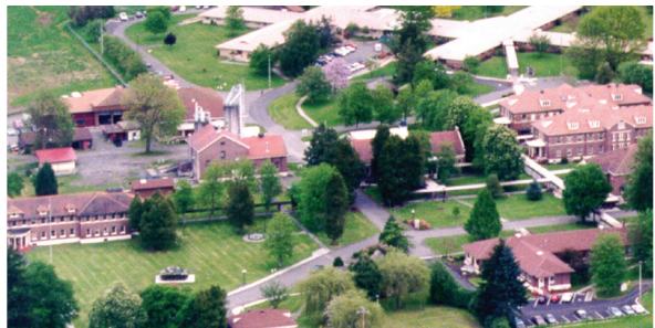
Washington Soldiers Home - Orting, WA