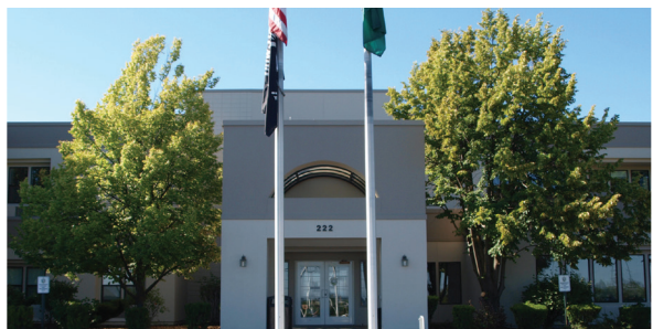
Spokane Veterans Home – Spokane, WA