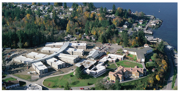
Washington State Veterans Home – Port Orchard, WA