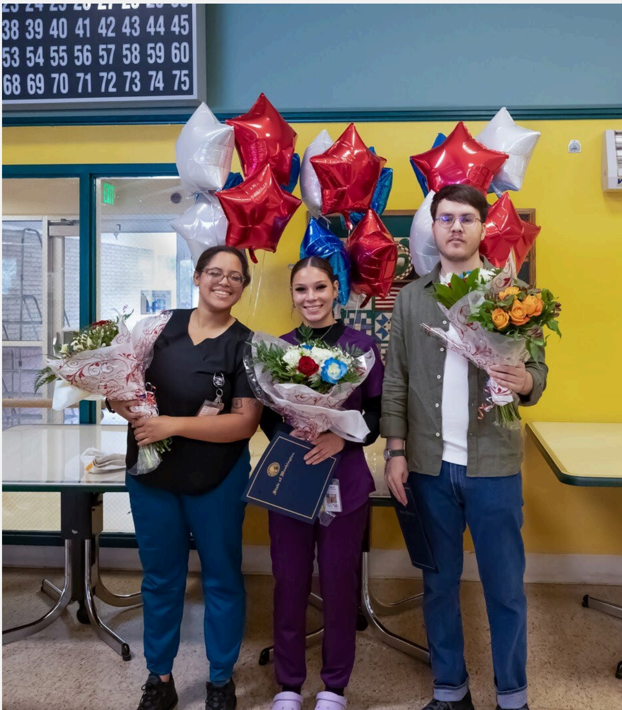
Washington Soldiers Home in Orting