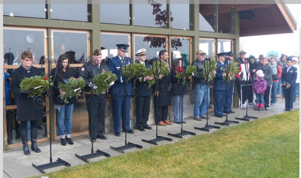
Walla Walla Wreaths Across America Ceremony