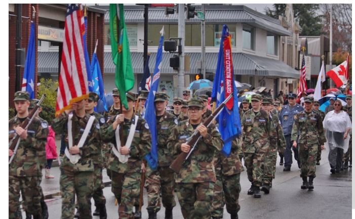
Photos from this year's 50th Annual Auburn Veterans Parade & 2015 WDVA Service Awards Luncheon