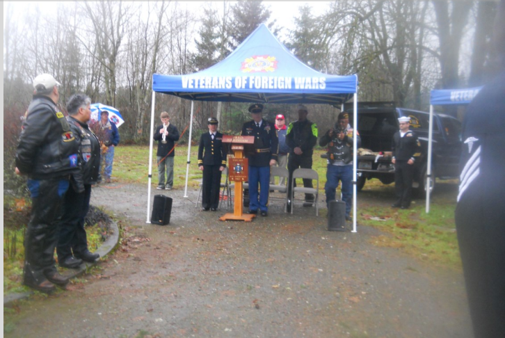
Medical Lake Wreaths Across America Ceremony