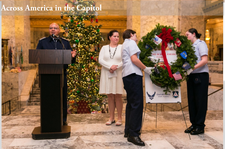
Retsil Wreaths Across America Ceremony