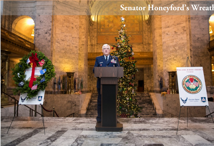
Senator Honeyford's Wreaths Across America in the Capitol