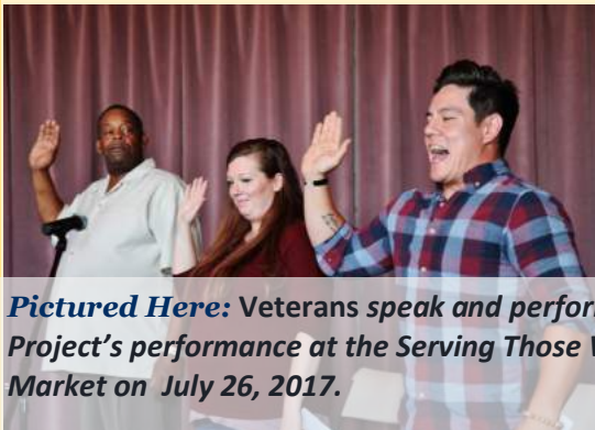
Pictured Here: Veterans speak and perform their military experience during The Telling Project's performance at the Serving Those Who Served Networking Social Hour at Pybus Market on July 26, 2017.