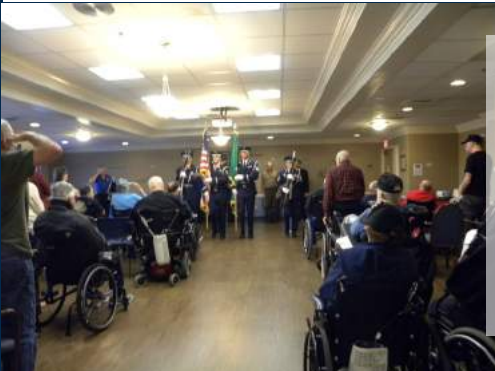
Spokane Veterans Home & Washington Soldiers Home in Orting