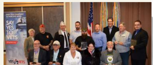
2016 Outstanding Service to Veterans Award Winners