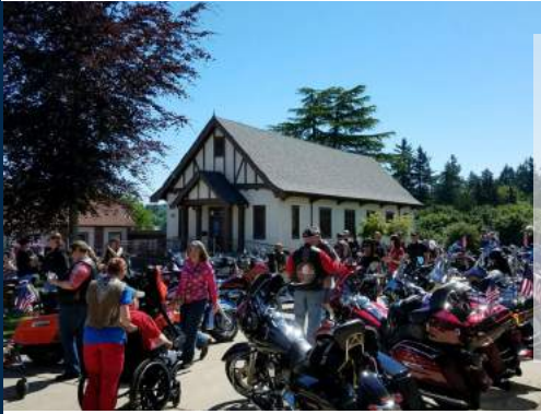
Fred Ross Memorial Ride & Washington Veterans Home in Retsil