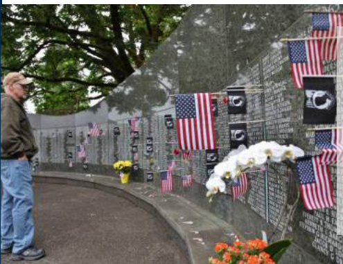
Olympia Thunder Run - Memorial Day Ride to the Capitol & Thurston County Veterans Council Memorial Day Ceremony