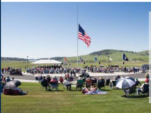
Washington State Veterans Cemetery in Medical Lake