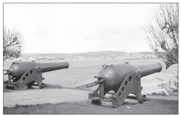
These canons facing the Inlet, were sent to the shipyard for scrapmetal.

In 1942, shortly after Pearl Harbor, the peaceful routine of the Home was interrupted. Activity at the Bremerton Navy Yard was stepped up, and thousands of people were hired to carry the workload. There was not enough housing available in the Bremerton area to handle this influx of new workers. Government officials looked over the Home facilities in hopes of taking them over and having the veterans move to some other part of the state. This idea ran into so many obstacles that the idea was abandoned and housing projects were built close to the Home to accommodate the overflow of Navy Yard workers.