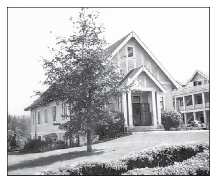
First Assembly Hall (converted to the Chapel in 1963)

An earthquake rocked the area on April 4, 1965, causing minor damage to several of the buildings. The