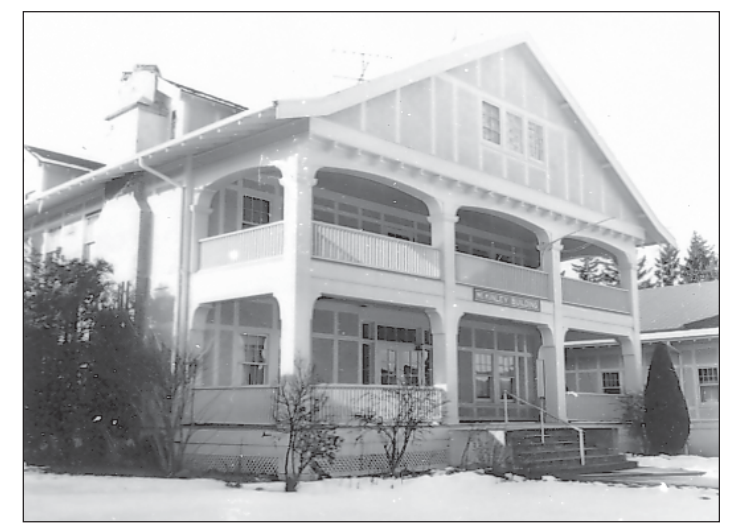
Originally McKinley was built as a Hospital.

Each year more veterans of the Grand Army of the Republic came to the Home in need of considerable care, thus necessitating an increase in the hospital staff. In 1929 the average age of the Civil War veterans was 84.5 years, the youngest being 82 years old. Scarcely a week passed without seeing one or more of them transferred to the hospital where they could receive constant care. The