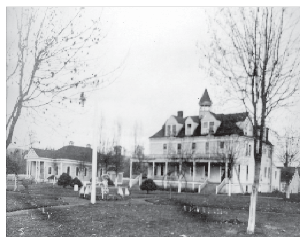
Washington Soldiers Home, Orting WA Assembly Hall 1894

The sum of fifty thousand dollars was appropriated to be used by the Board of Control as required. The Board, which consisted of five legislators appointed by the Governor, was authorized to purchase a site, construct buildings, and supervise maintenance.