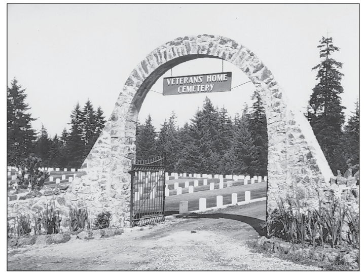
Veterans Home Cemetery

In 1916, during the administration of Governor