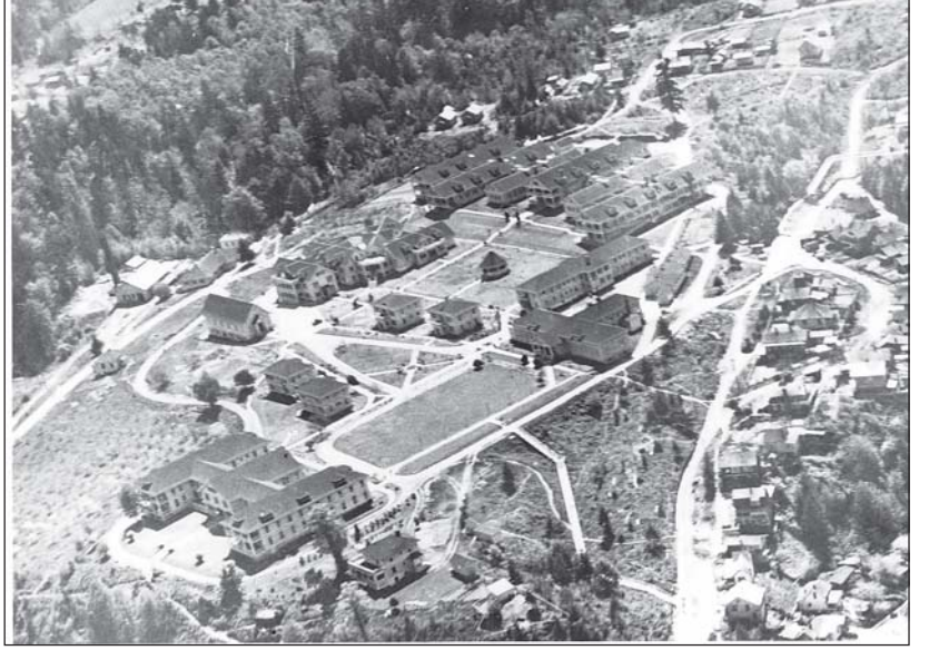
gram to be instituted and the grounds soon became even more attractive to visitors and members.

The position of a head gardener was established in 1928. This enabled a more complete landscaping pro-