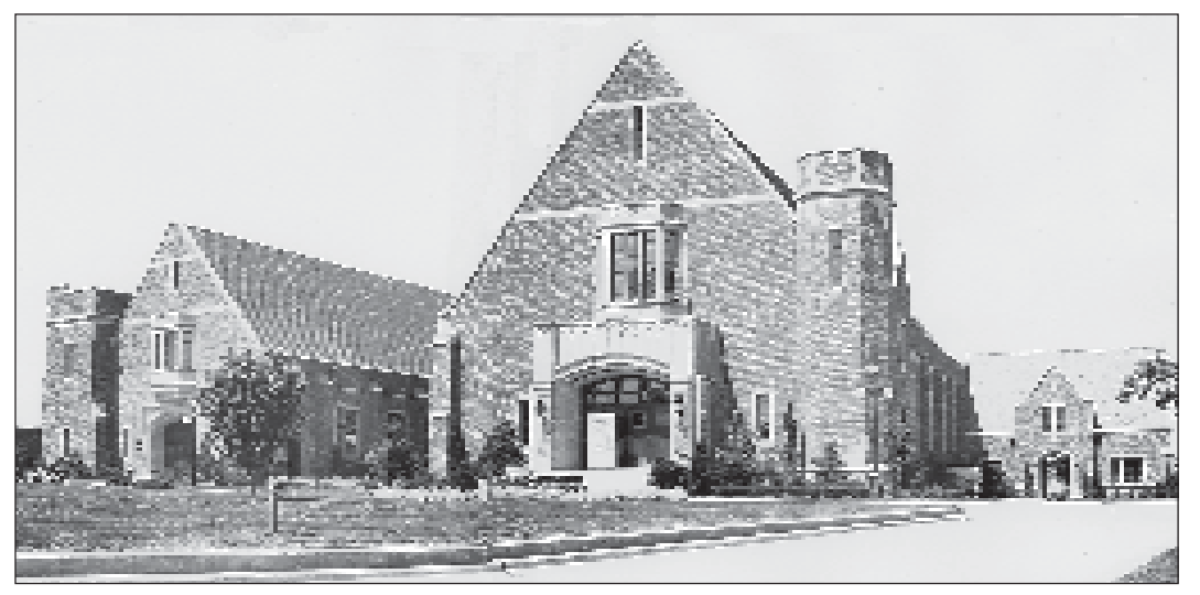
Auditorium / Dining Hall

Spanish War Veterans attained a majority of the membership during this period and it made a better feeling between the different factions. The Civil War men were passing on with more and more frequency, and the Spanish War men would carry the flag and conduct the patriotic services and eventually assumed the duty of conducting funerals for the Civil War men. Antagonism gradually disappeared and a feeling of real comradeship prevailed.