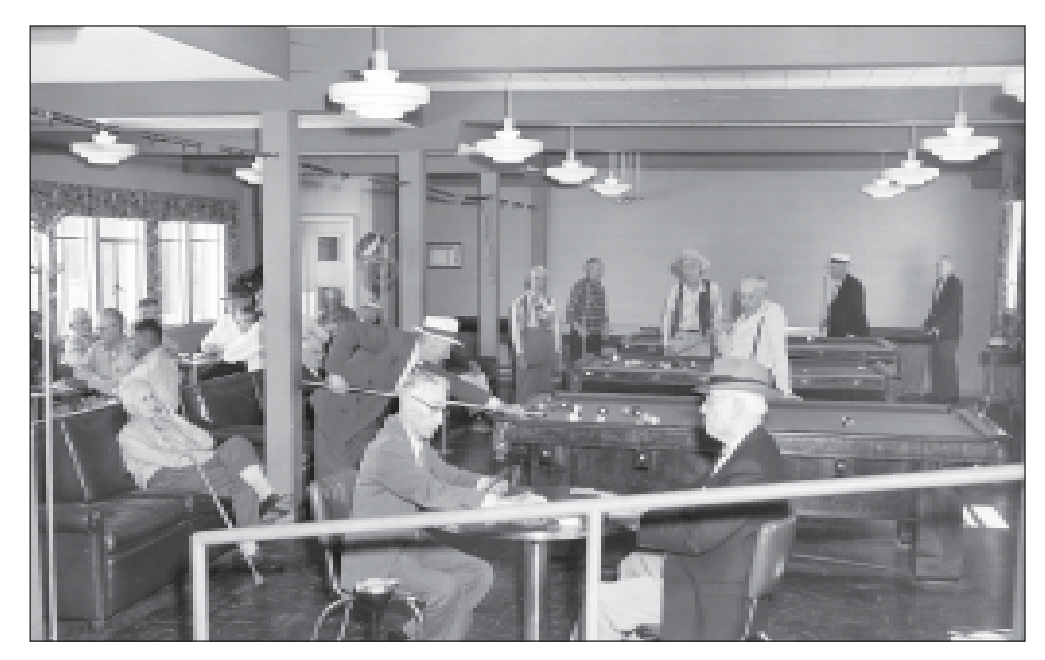
A Friendly game of pool or cribbage.

The post office, which had been located in Washington Building, moved to new, larger quarters on the square. The barber shop found a permanent location on the square, having been originally located in the