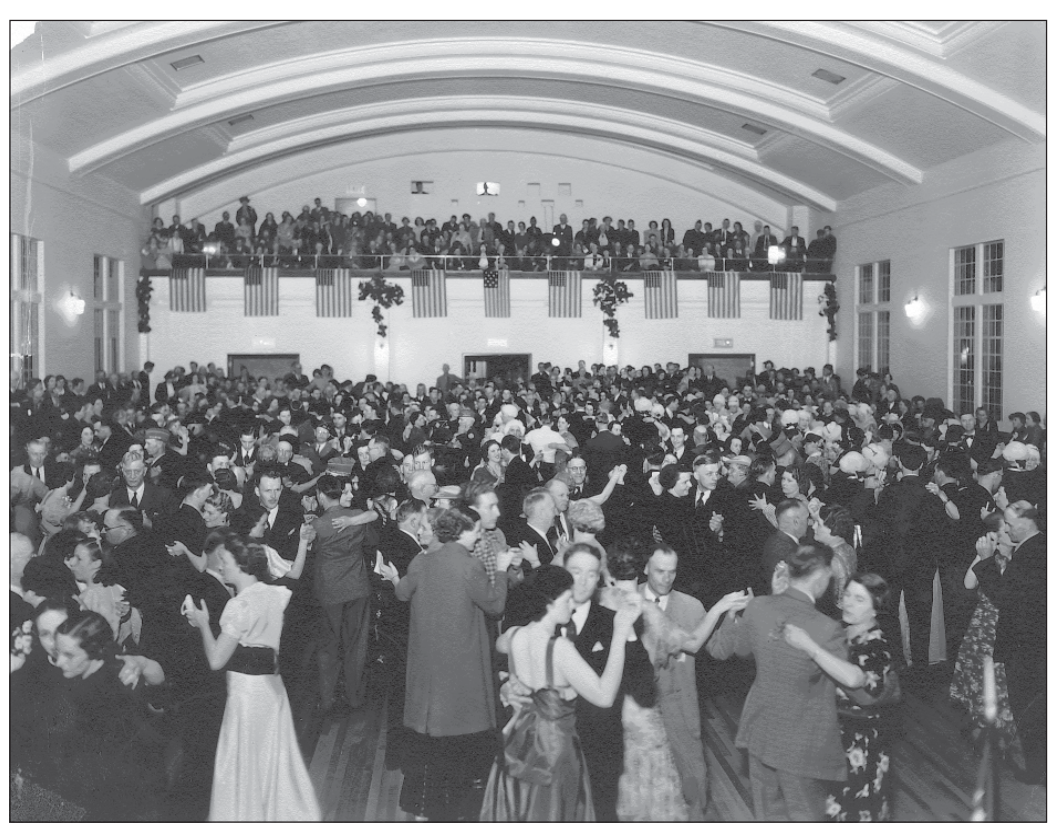
Dedication of the Home's largest construction program since its beginning was held on November 11, 1953, and ended with a Grand Ball.

Dedication of the Home's largest construction program since its beginning was held on November 11,