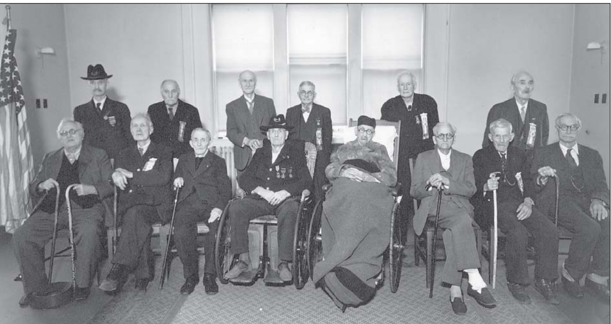
Grand Army of the Republic Veterans

At Retsil at this time, the advanced age of all the Grand Army of the Republic (GAR) veterans brought to the home more members who were unable to take care of themselves so the hospital force was increased considerably. By September 30, 1922 the population was 426 Civil War veterans, 28 Spanish War Veterans, and 3 World War veterans for a total of 457. There was still a great deal of friction between the GAR veterans and those of the Spanish War, creating a sizable problem for the Administration. It had grown to proportions where, in