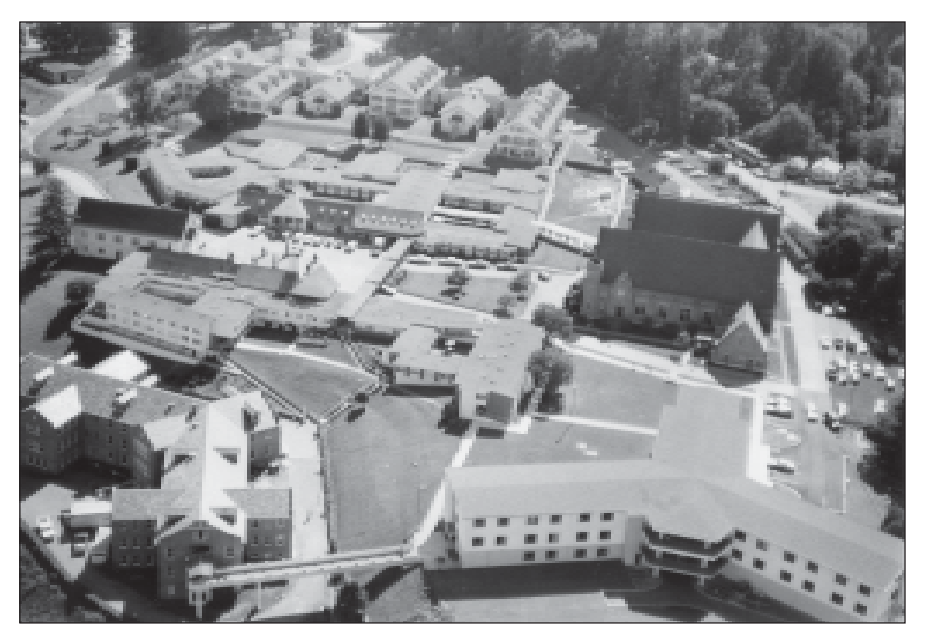
The Grounds in 1979. Building 10 in the foreground.

Formal groundbreaking ceremonies were held on December 2, 1977, for the new nursing care unit (Building 10). Construction of this new 78-member unit was completed in 1979, and the first residents moved in on May 14, 1979.