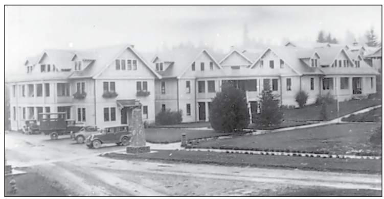
The Olympic Building

Major improvements undertaken during the last few years of this first decade included adding another fourwing dormitory, an officers' dining room, and a diet kitchen to the hospital building (McKinley Building); a morgue and garage at the rear of the hospital; and grading and graveling a permanent driveway from the country road to the office.