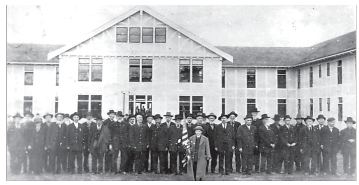
First members of Washington Barracks

About one and one quarter acres of land on the lower portion of the grounds was cleared. drained, and put into cultivation. It was recommended that a sea wall be built to keep the high tides from washing the land. An orchard of 200 fruit trees was planted on the