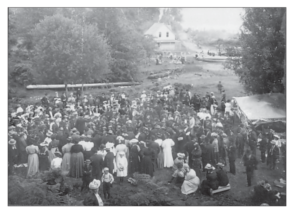
Port Orchard businessmen hold a picnic on the beach of Sinclair Inlet.

In 1913 the state Legislature passed a law authorizing the admission of veterans' widows to the Home. The first widow was admitted on April 2, 1914, and 122 widows were admitted during the next 12 months. It was necessary to provide quarters for these women. A request for an appropriation of $25,000 for housing was made and granted. Additions were made to the hospital, now known as the McKinley Building, and the Sherwood Building was erected to accommodate 48 women.