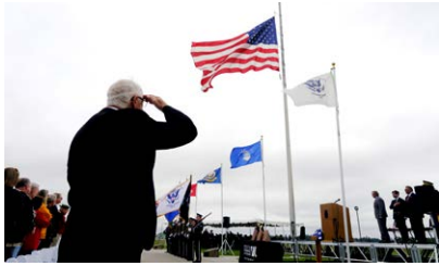
Memorial Day at WA Veterans Cemetery