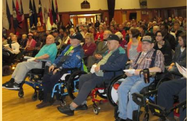
Thank you to all the veterans service organizations, community groups and individuals for your contributions and participation in the WA Soldiers' Home 2016 Veterans Day Program!