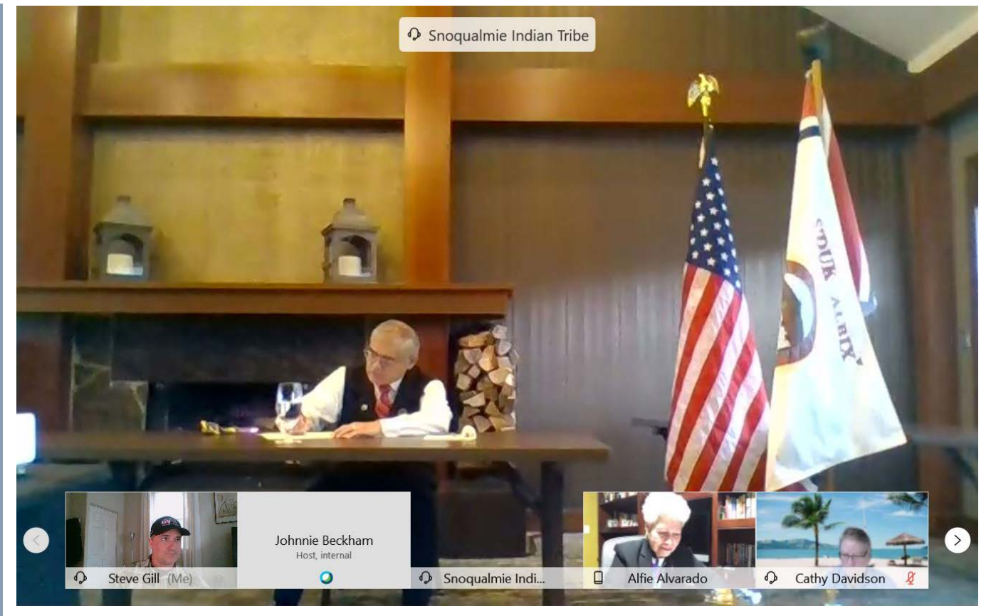
(Pictured above from virtual signing that took place among the tribe and WDVA. Photo taken on November 04, 2020)