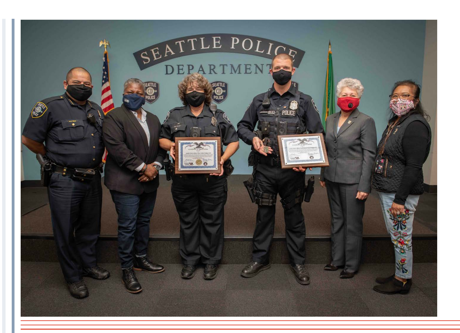
Veterans License Plates