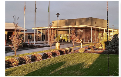
Walla Walla Veterans Home