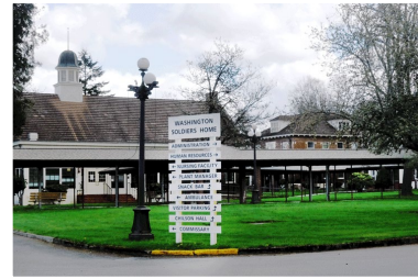
WA Soldiers Home