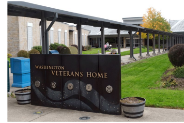
WA Veterans Home