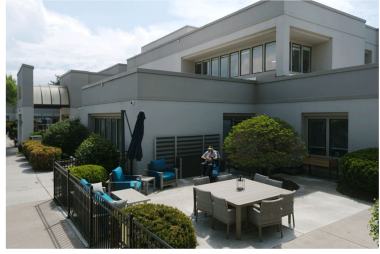
Spokane Veterans Home