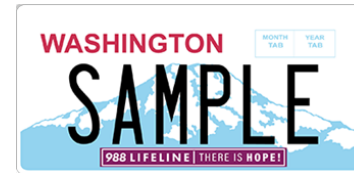
New Suicide Prevention License Plate Emblem